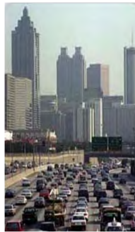
Atlanta Regional Commission

Humans can live a few weeks without food, a few days without water, but only a few minutes without air.